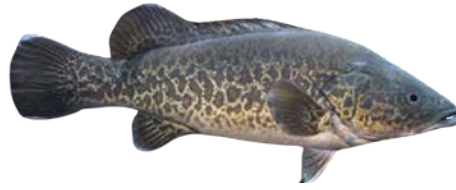
Mary River Cod

Cod became locally extinct in Ipswich's waterways 100 years ago due to overfishing.