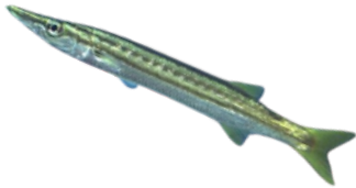
Yellow Tail Pike