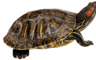
Red Eared Slider

The above invasive species MUST BE DISPATCHED HUMANELY. Using a brain spike is best. Fish must NOT be returned to the water dead or alive. They must not be used for bait. They must be properly disposed of.